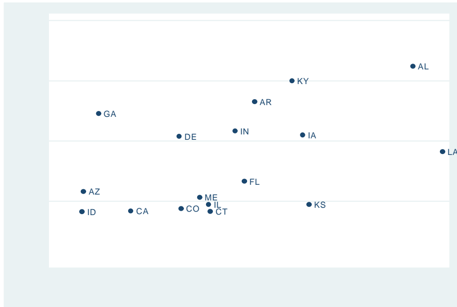
Percentage Changes in Offshoring and Immigration by State (2000-2006)