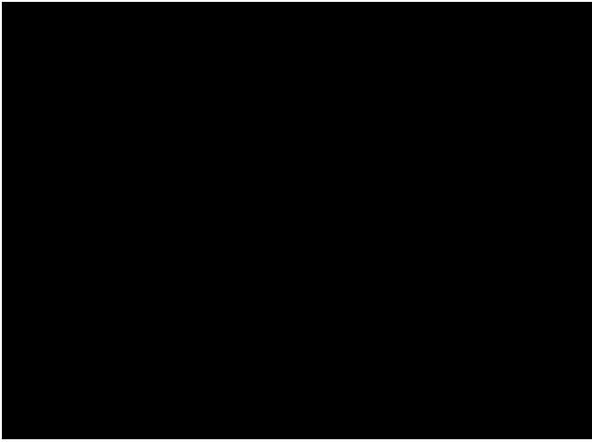
FIG. 1. ( ) N -1/2 R = N / 2